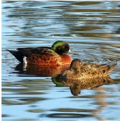
Chestnut Teal A lovely chestnut-brown duck with a green head.