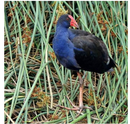
Swamphen A large, purple hen-like bird with large toes and a scarlet bill and forehead.