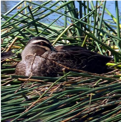
Black Duck Familiar grey-brown duck with a black stripe through the eye.

Wetlands like McNeilly Park, Bellbird Park, Crystal Waters and Alex Goudie Park lake are always good places to find waterbirds.