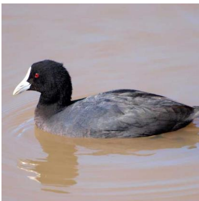
Coot Small, black waterhen with a white bill and face-shield.