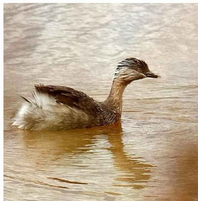
Grebe Small duck-like bird that dives for plants and animals on the bottom of the lake.